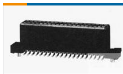
TE Part # 147378-8 100 SYS50 SMT RCPDR SHD W/O HD