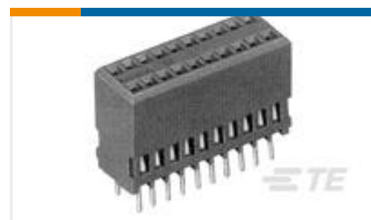
TE Part # 104744-5 100 SYSTEM 50 RCPT ASSY DRST