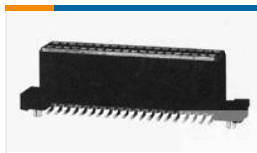
TE Part # 104550-9 100 SYS50 SURFMNT DRST RCPT